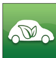
World Book Digital Libraries Living Green