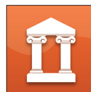
World Book Digital Libraries Early Peoples