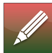
World Book Student