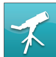
World Book Discover