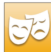
World Book Dramatic Learning