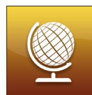
Social Studies Power