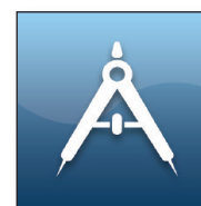
World Book Advanced