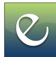
World Book eBooks