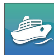
World Book Digital Libraries Inventions and Discoveries