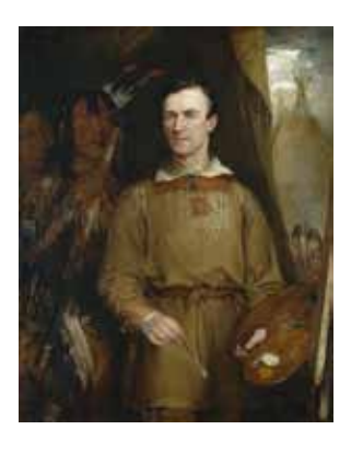
George Catlin ©Smithsonian Institution

Although they had many things in common, there were often bad feelings between African-Americans and Indians. Some Indian slave owners were as harsh and cruel as any white slave master. Indians were often hired to catch runaway slaves. In fact, slave-catching was a lucrative way of life for some of the Indians, especially the Chickasaws. For the return of a runaway slave, the Indian could expect to get a musket