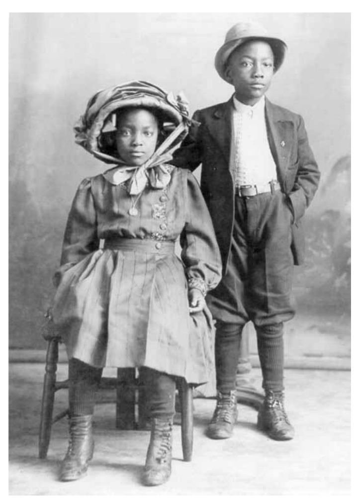
African-American children in dress clothes around 1900.