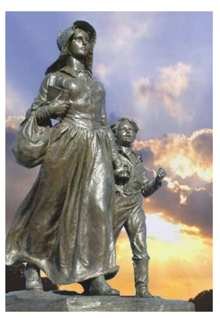
Pioneer Woman statue in Ponca City.

no single pioneer woman, no single description. They came from all walks of life and created their existence in many different ways. What binds them into one is the perseverance, the endurance, the tremendous spirit that enables them to turn a prairie into civilization.