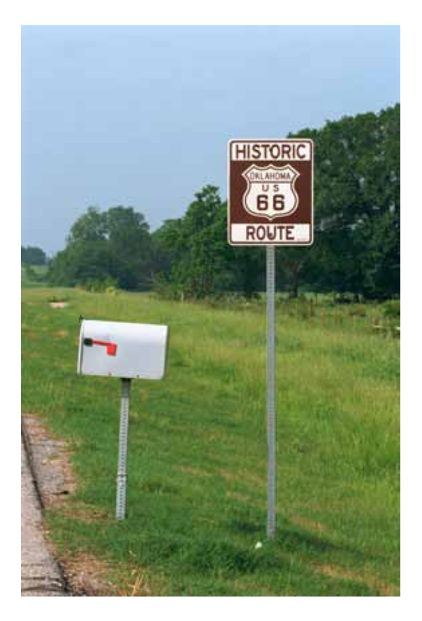
Old U.S. Highway 66 is still marked with signs. Travelers from around the world come to the U.S. each summer to travel the old route.