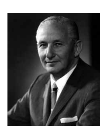
Sylvan Goldman invented the shopping cart.

In 1998, Oklahoma ranked twenty-sixth among states with Hispanic populations. At that time, 130,168 people of Hispanic heritage lived in the state. That figure showed a 51-percent growth over the 1990 figure of 86,162. In the 1990s, more than 44,000 people of Hispanic origin