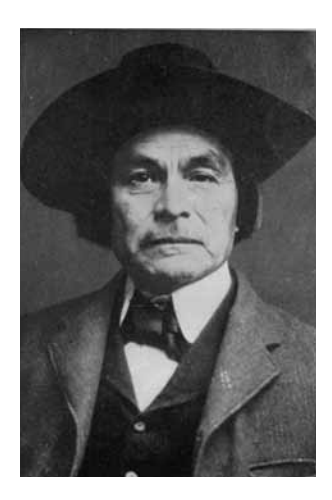
Chitto Harjo or Crazy Snake

9. The Atoka and Creek agreements were fully explained and ratified, subject to ratification by the tribes. If the tribes would accept the Atoka and Creek agreements, the Curtis Act would be null and void;