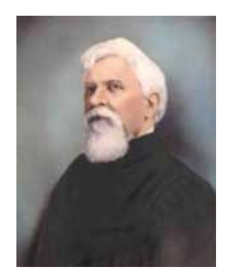
Judge Isaac Parker

What was the Major Crimes Act? Indian tribal courts continued to try cases involving members of their nations. In 1885, however, the Major Crimes Act limited their authority. Afterwards, tribal courts handled only civil cases and lesser crimes. Federal courts had to handle Indian cases involving murder, manslaughter , rape, assault, arson, burglary, and larceny . In 1888 the tribal courts were abolished altogether.