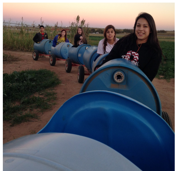
Beta students enjoy the train ride.